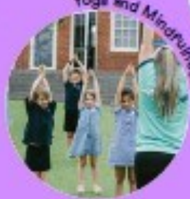
Yoga and Mindfulness