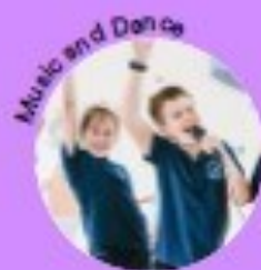
Music and Dance

In any one week, children could be participating in science experiments, active play, creative expression and more – we believe in learning through experience so that each child can grow into who they want to be.